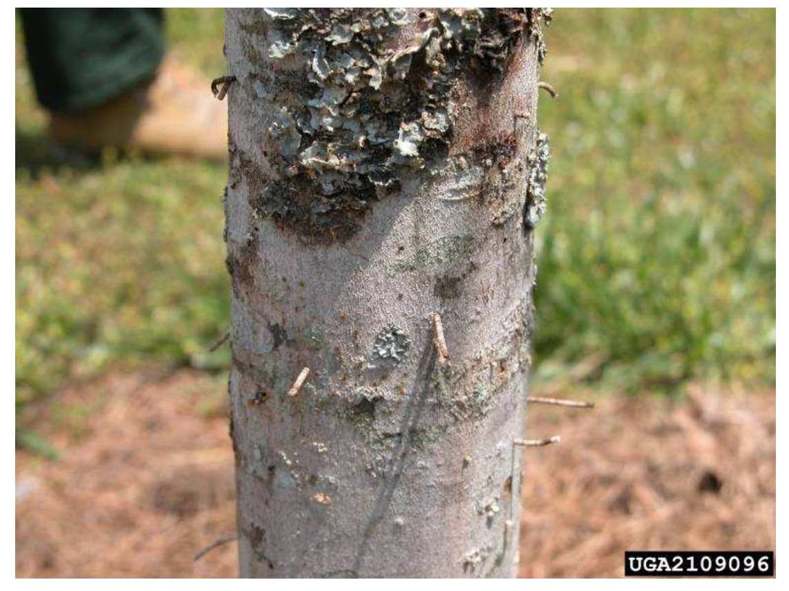
(Above: Frass tubes made by granulate ambrosia beetle.)

Females also introduce a symbiotic ambrosia stain fungus on which the larvae feed.