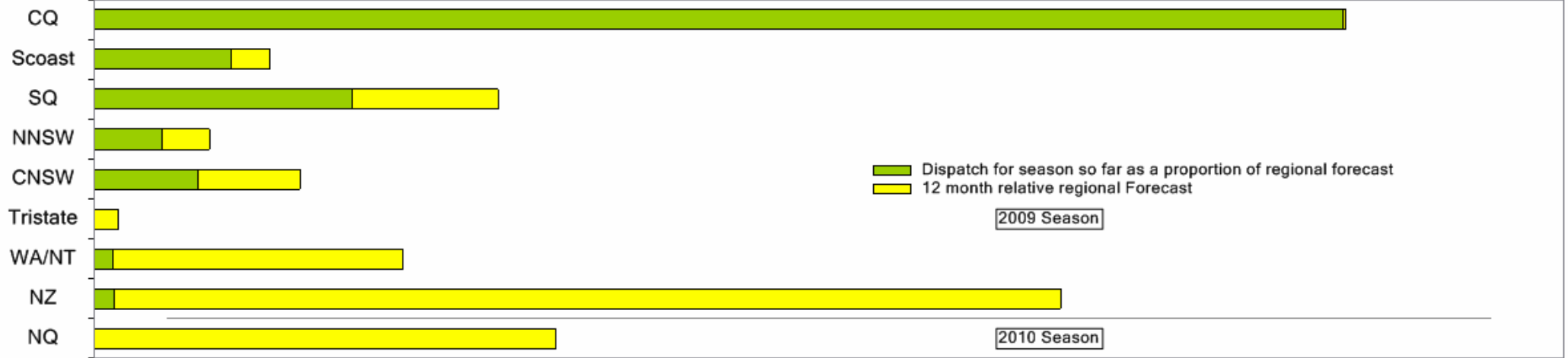
Throughput Australian & NZ avocados by destination state Throughput 1st January 2009 to date = 5,920,196 5.5kg tray eqv