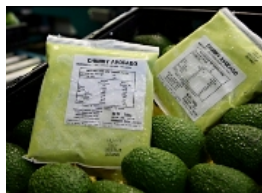
Simpson Farms Premium Chunky Avocado

Simpson Farms has the largest supply base of fresh avocados in Australia, processing 100 per cent Australian avocados from north, central and south Queensland. Earlier this year Red Rooster adopted their high pressure chunky avocado with no preservatives or additives to go into the new Free Range D'lish burgers and wraps.