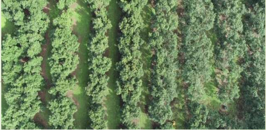
Large tree orchards – the first step of window pruning and selective limb removal