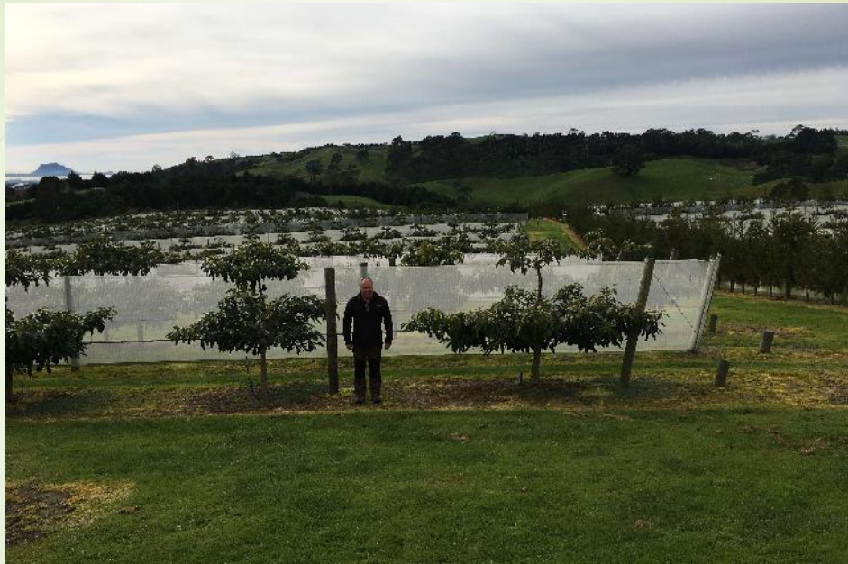
Small trained trees – very intensive