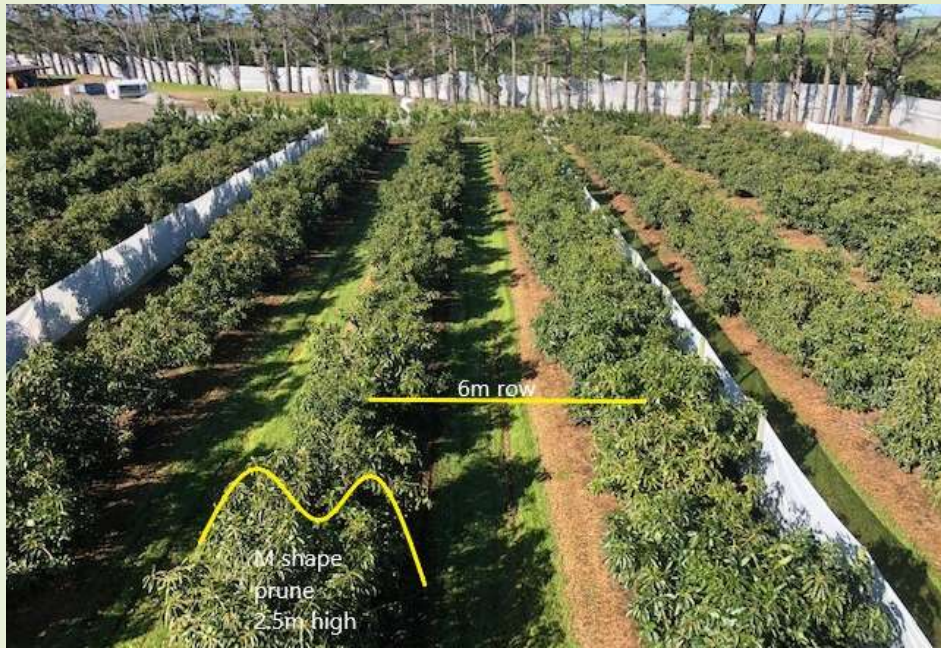
Small tree orchards – after prune