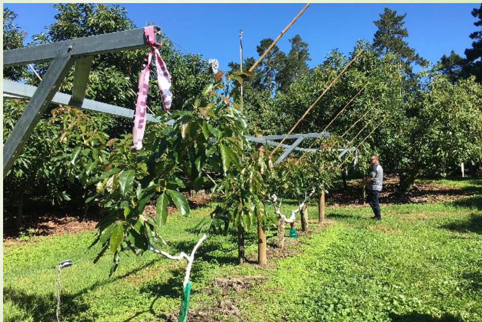
Small trained trees – very intensive