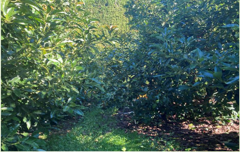
Small tree orchards – before prune