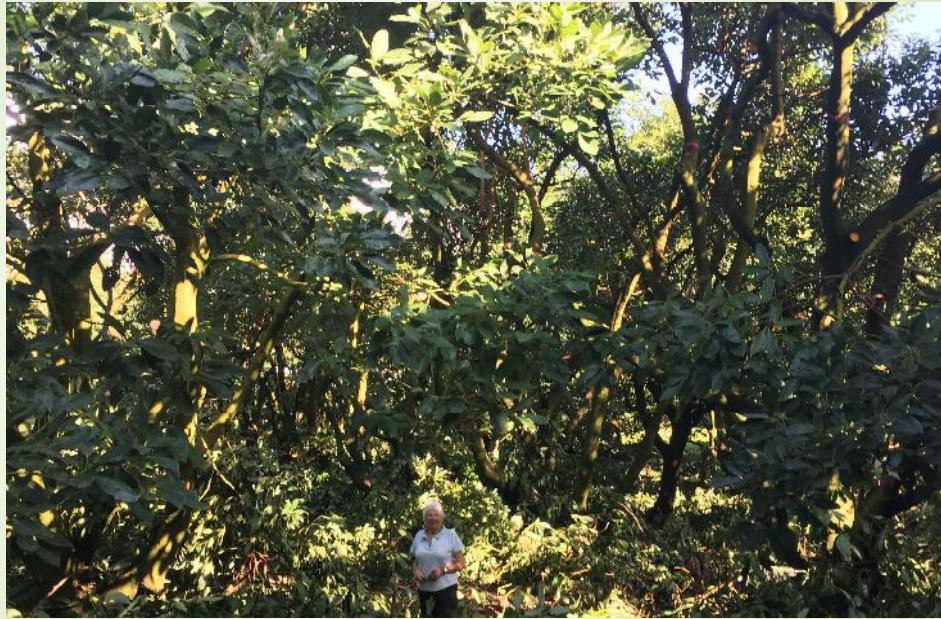
Large tree orchards. The first prune is messy with lots to clear