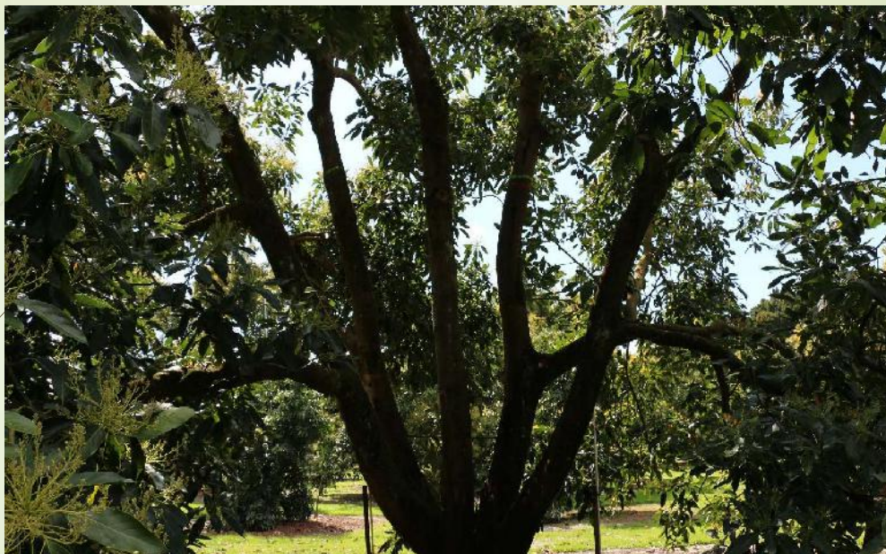
Large tree orchards – end result of window and selective limb pruning