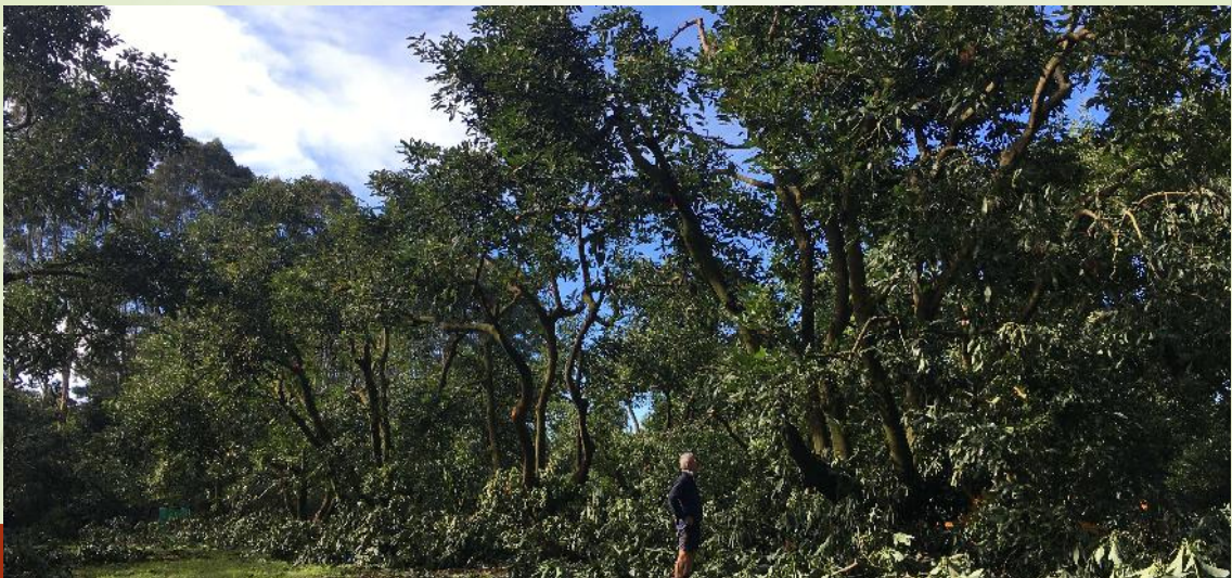
Large tree orchards. Closeup from the ground of the starting process