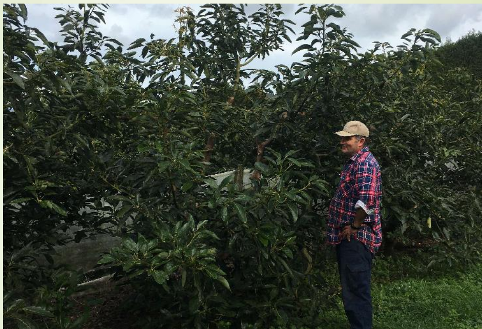
Small tree orchards – after prune