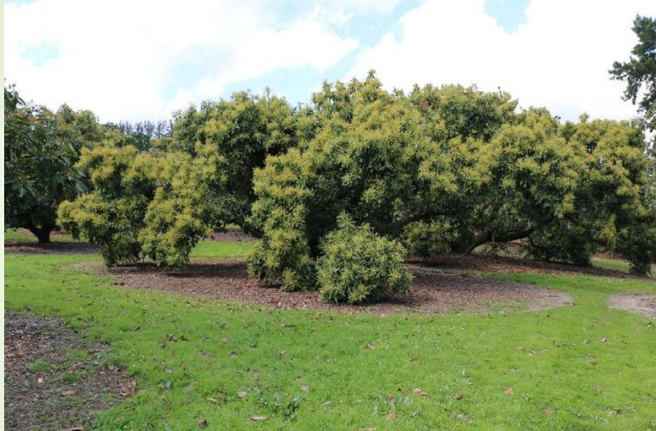
Flower pruning – potentially heavy set