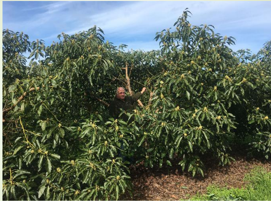
Small tree orchards – after prune