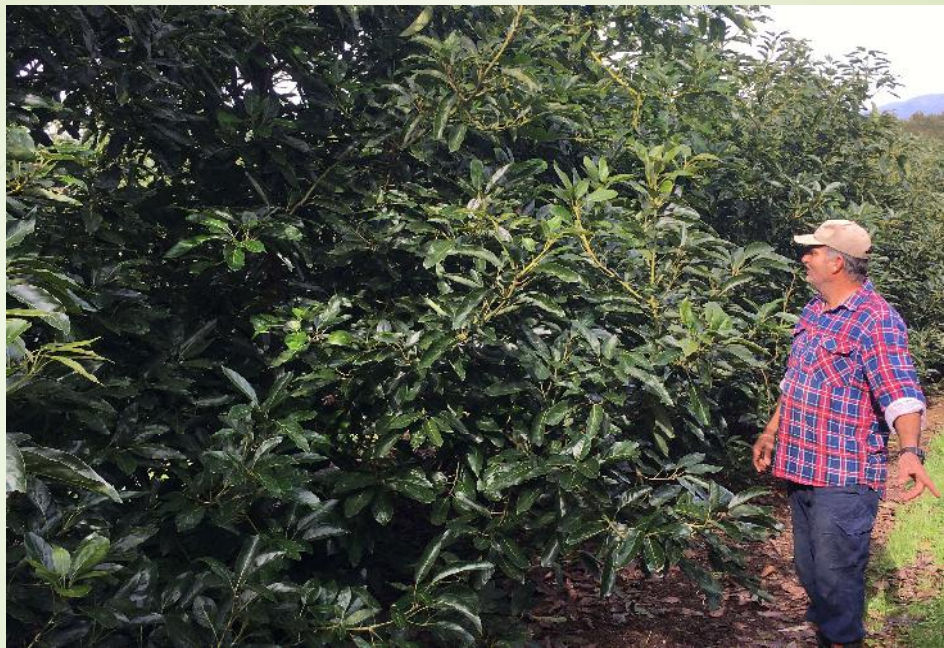
Small tree orchards – before prune