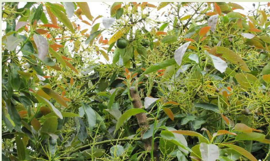
Flower pruning – regrowth in December after making the prune in Sep/Oct.