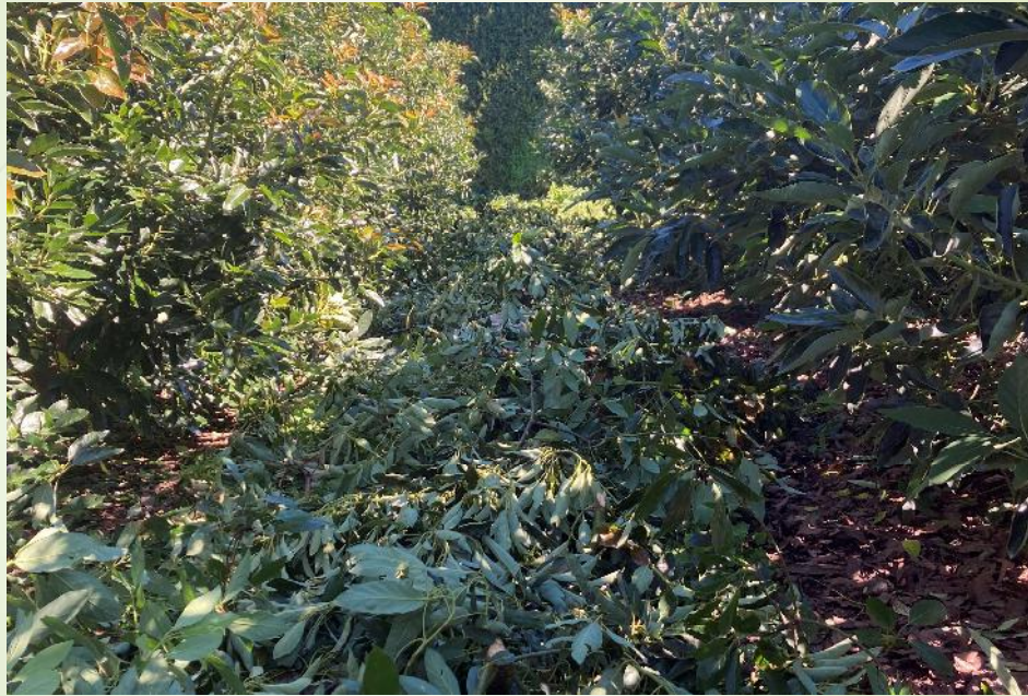
Small tree orchards – after prune