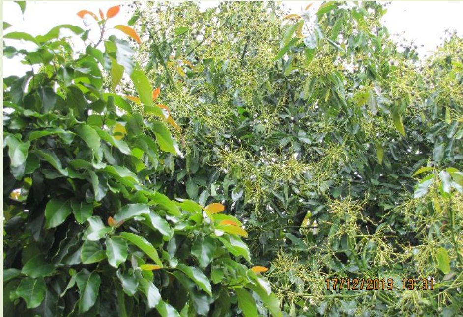
The pollenizer effect